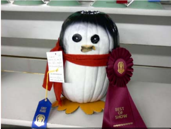
It's Getting Cold Out There!

Wow, it's really starting to get cold outside, but the E.T.C. is sizzling! October has really been an exciting month for the E.T.C. members. Our group headed to Fairview Church for a night of fun, as we played "Fairview Survivor." While at Fairview, our young people also played a game called Mega-Ball Volleyball. Just imagine playing volleyball with a 42" diameter ball! Now our young people insist on playing events such as